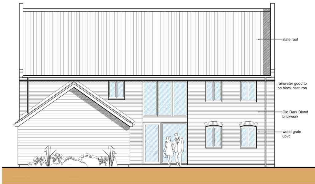
Front Elevation Scale: 1:100