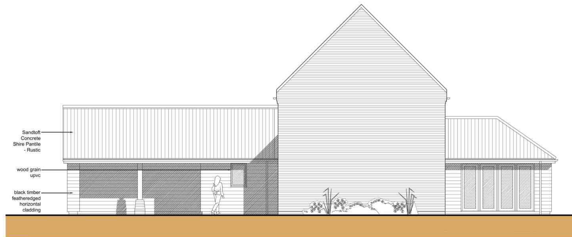
Side Elevation Scale: 1:100