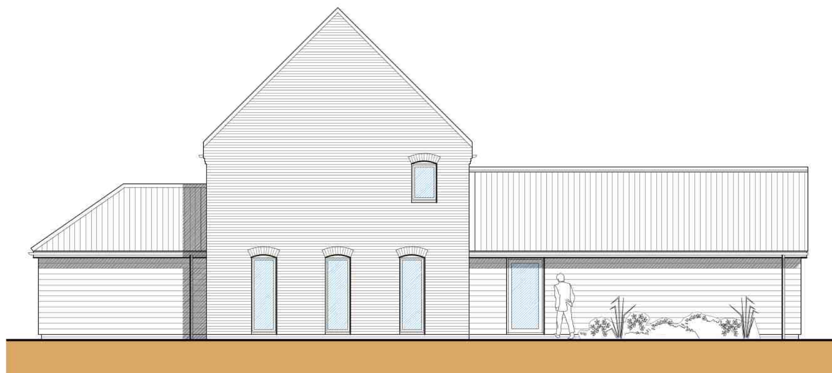
Side Elevation Scale: 1:100