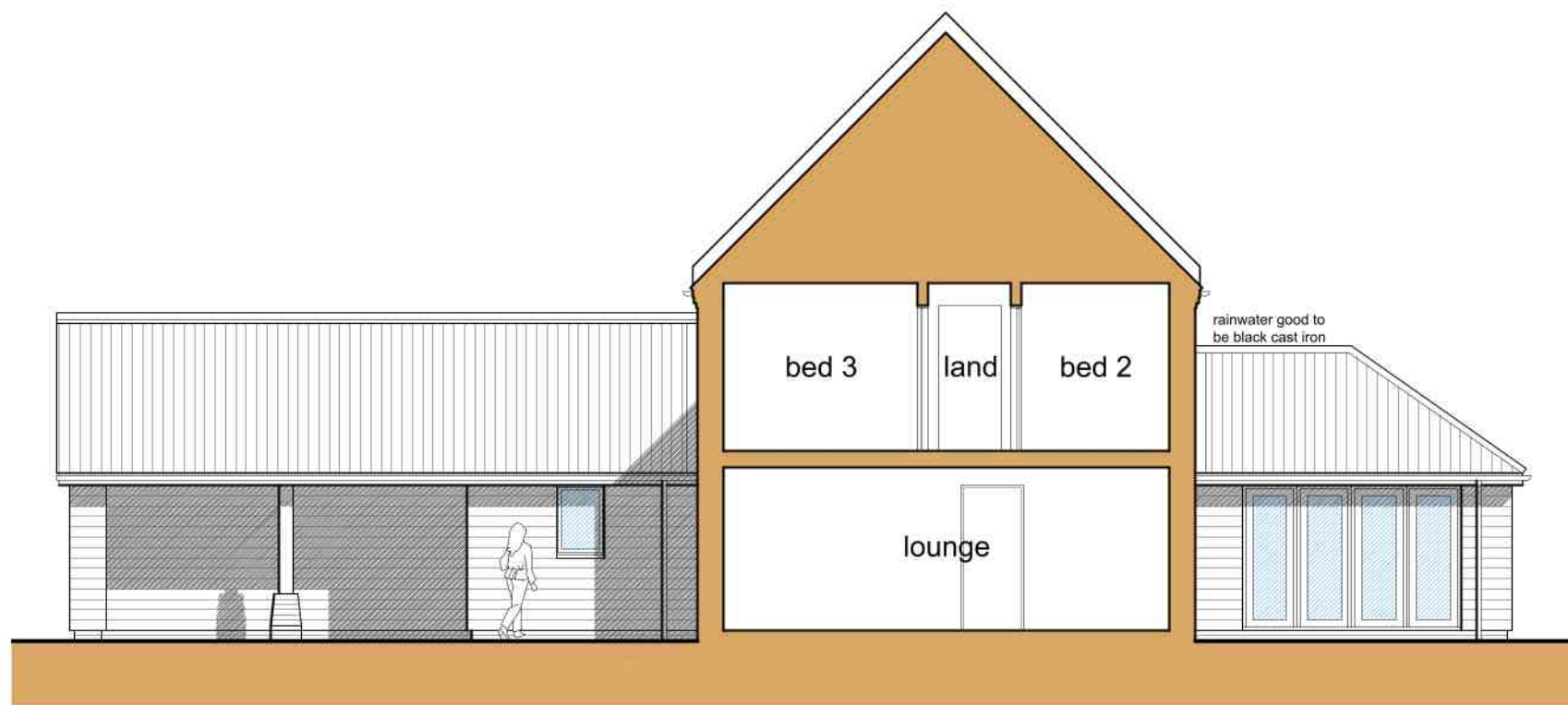
Section A-A Scale: 1:100