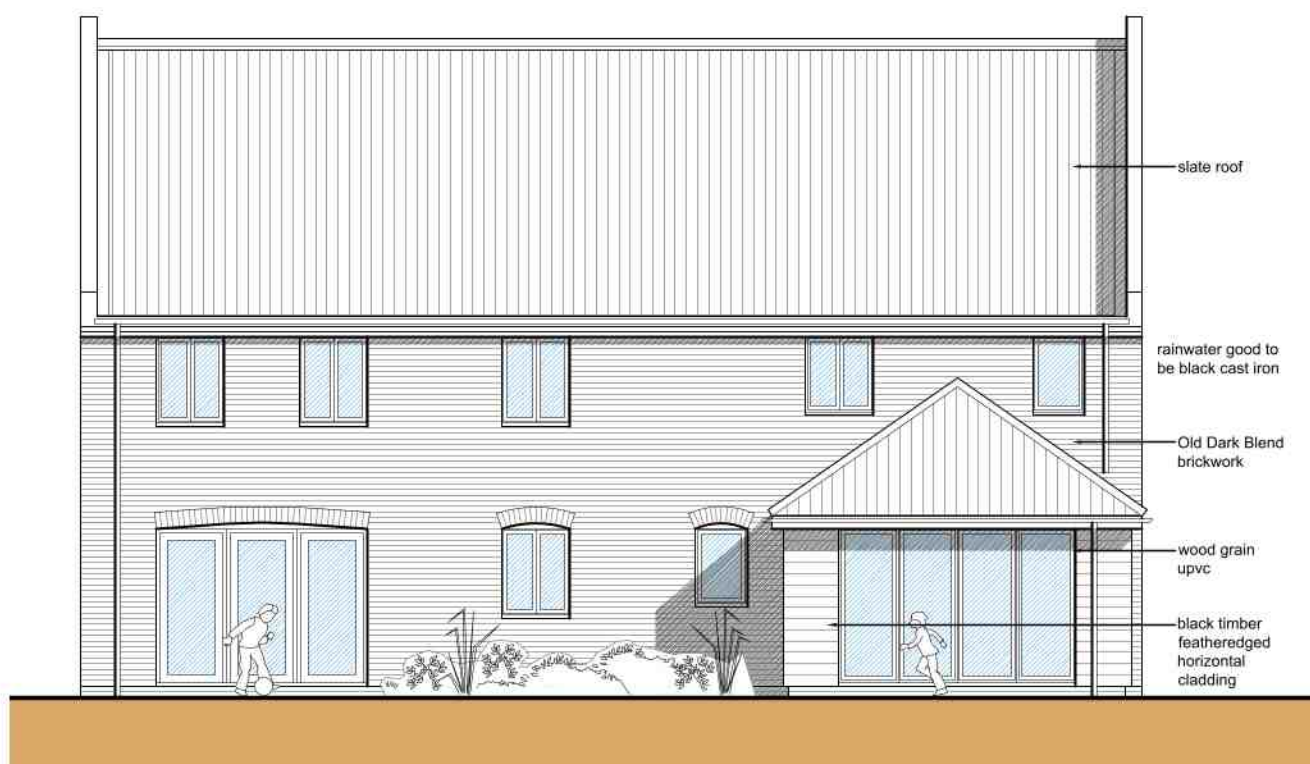
Rear Elevation Scale: 1:100