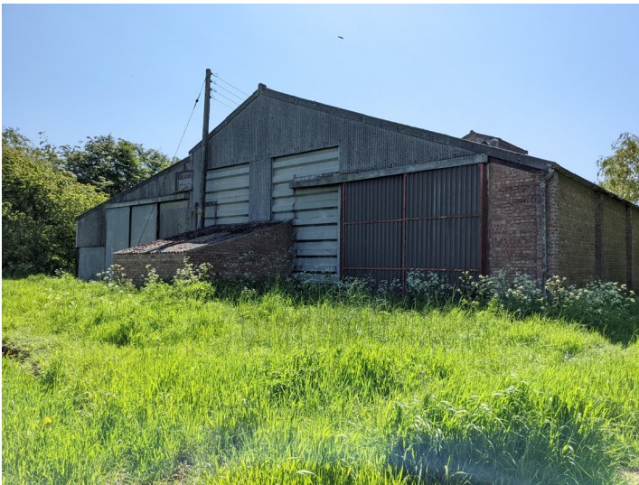
2. View of rear of grain store facing the fields to the north, showing self seeded grass meadow vegetation. Tree cluster visible on the left is on adjacent land. Brick wall forming the west wall of the grain store visible on the right hand side, with brick pier structure on the outside suggesting that any earlier structures faced 'inwards' and were therefore contained within the footprint of the grain store. No other footings, slabs or rubble are present elsewhere on the site.