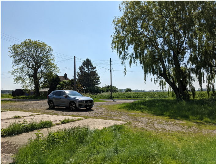
7. View of hardstanding to the front of the grain store, showing concrete formed of 4 slabs in good condition and clear of staining or cracks. Adjacent residential property visible beyond.