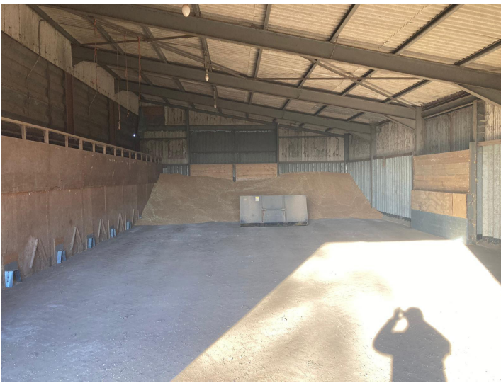
8. Interior of grain store showing structure in good condition, clean and clear of any signs of contamination, spillages or chemical attack.

Hither Hold Farm, Further Old Gate Screening Assessment Photographs 31.05.2022