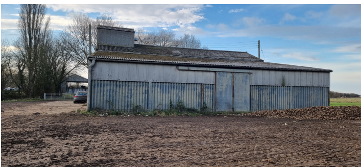
3. View of grain store from the west showing the ground in agricultural use after the winter season.