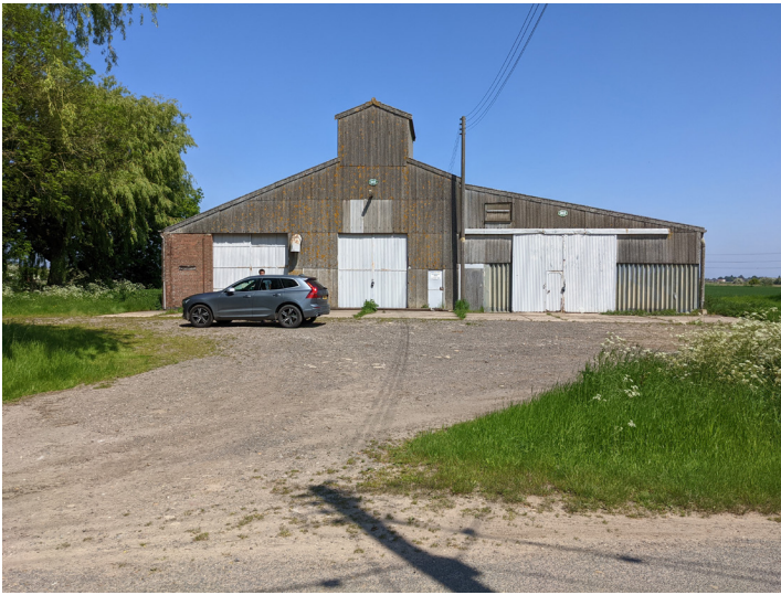
1. View of front of grain store as seen from Further Old Gate, showing hardcore access track and vegetation along the road either side.