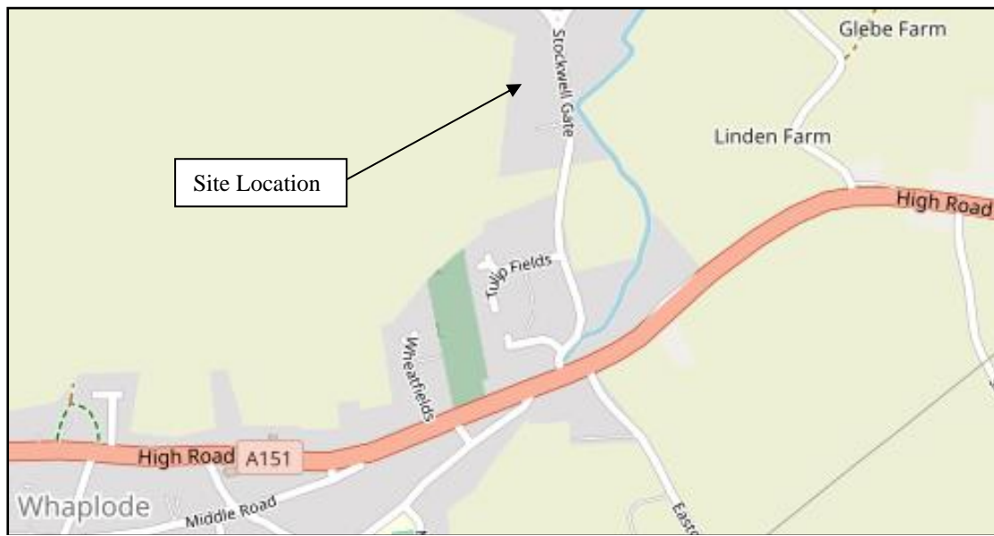
Figure 1 – Location Plan (© OpenStreetMap contributors)

The location of the site is shown in Figure 1.