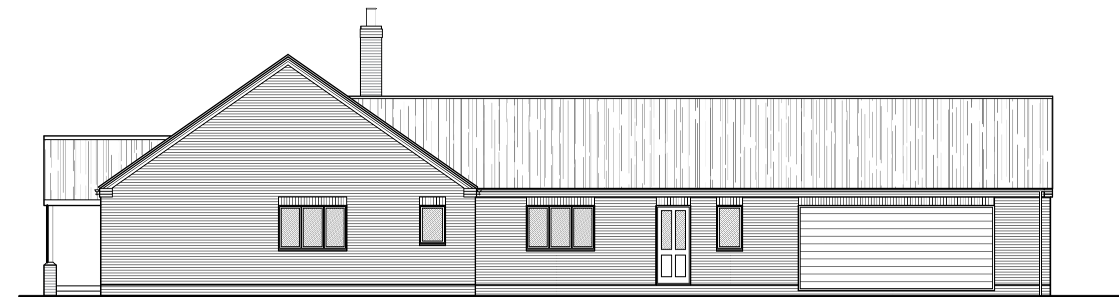
SIDE ELEVATION - NORTH