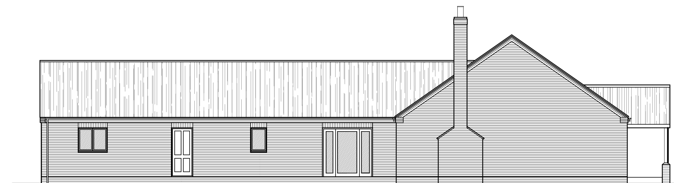
SIDE ELEVATION - SOUTH