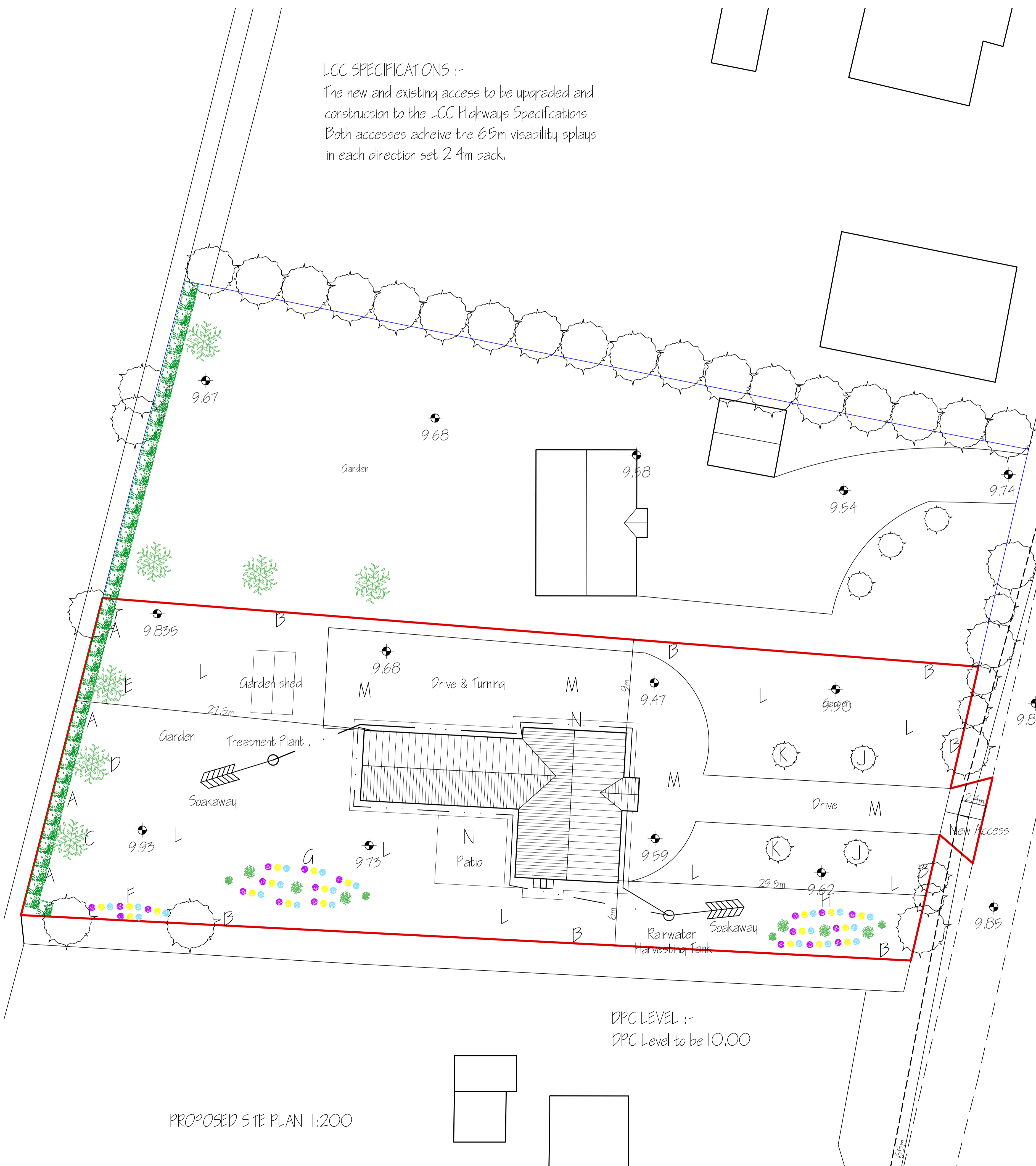
PROPOSED SITE PLAN 1:200

LCC SPECIFICATIONS :- The new and existing access to be upgraded and construction to the LCC Highways Specifications. Both accesses achieve the 6.5m visibility splays in each direction set 2.4m back.